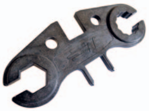
Field Tool - multiple functions, PN 1971903-1