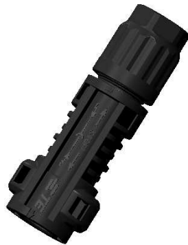
See Fig 1 Connector Male PV4-SMx/S1Mx..... (PN 2270024)

The connector allows for 2.5mm 2 / AWG14, 4.0mm 2 / AWG12, 6.0mm 2 / AWG10 cable according to EN 50618:2014 (see Fig.1 and Fig.2)