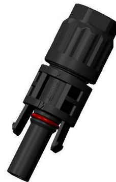
See Fig 2 Connector Female PV4-SFx/S1Fx..... (PN 2270025)